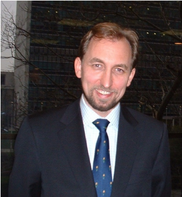
Prince Zeid Ra'ad Zeid Al-Husseini

“An on-site court martial would demonstrate to the local community that there is no impunity for acts of sexual exploitation and abuse by members of military contingents. . . . Therefore, all troop-contributing countries should hold on-site courts martial. Those countries which remain committed to participating in peacekeeping operations but whose legislation does not permit on-site courts martial should consider reform of the relevant legislation.”